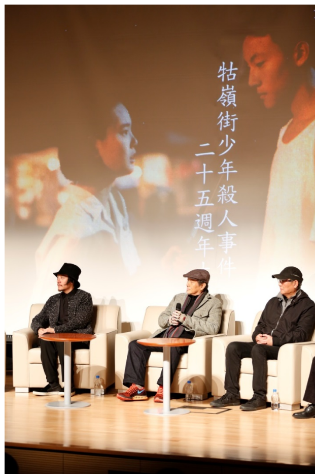
Masterclass of A Brighter Summer Day