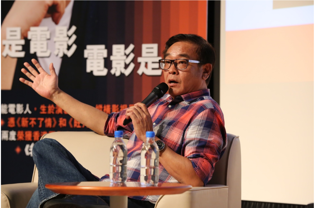
Masterclass with Award-winning Director Derek Yee