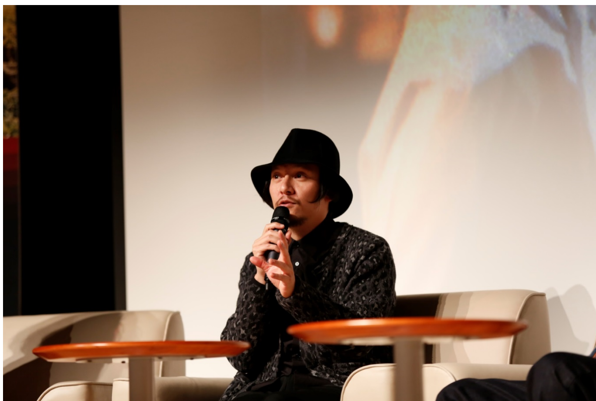
Award-winning Actor Chen Chang