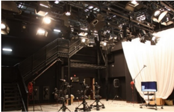
High Definition industry standard TV & film studio

The Academy offers students hands-on experience in filmmaking and familiarise them with the latest technological developments in the film and creative media industry. Apart from being the first publicly funded university in Hong Kong to provide two high definition television and film studios for comprehensive training in television and film production, the Academy is currently building a sound editing and mixing theatre with a specification that would become the region's exemplary model in the education sector. Also being developed is a VR studio, which the Academy intends to equip its students with the upcoming medium for storytelling.