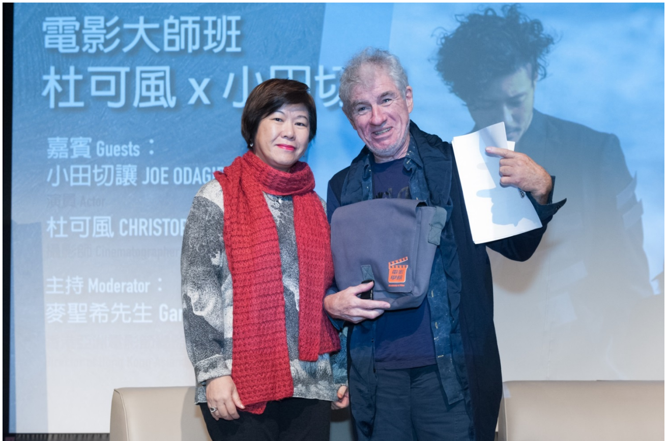
Masterclass with Award-winning cinematographer Christopher Doyle