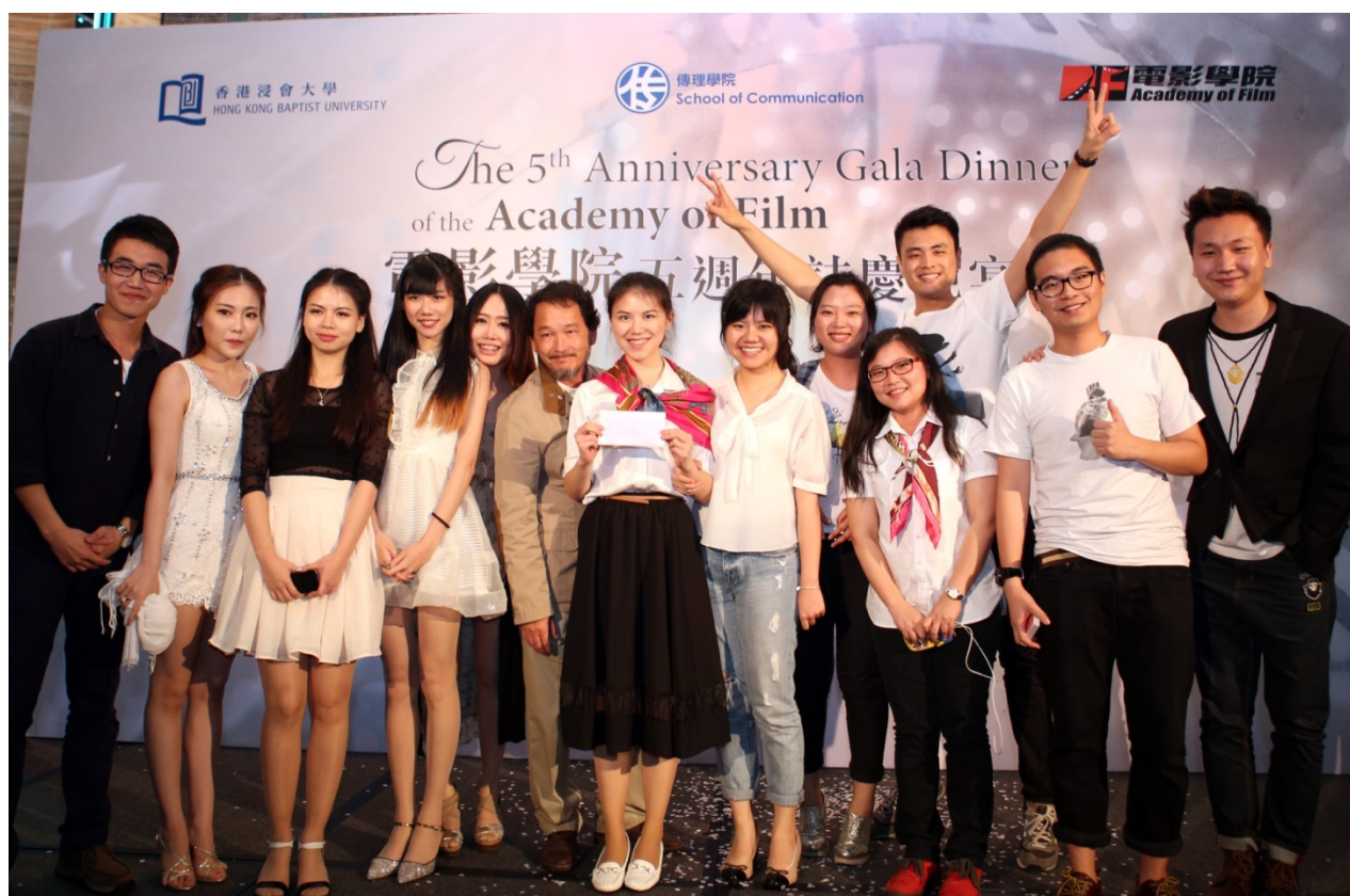
The 5th Anniversary Gala Dinner of the Academy of Film