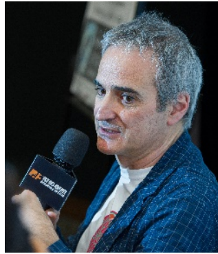
Cannes Film Festival Best Director Olivier Assayas