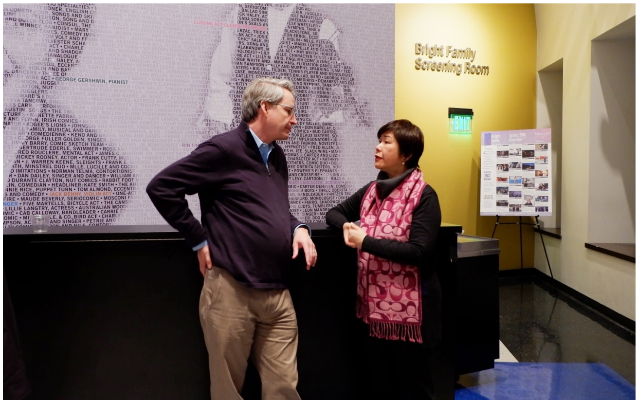
Home Project: HK/US Exchange Tour Visit to Emerson College