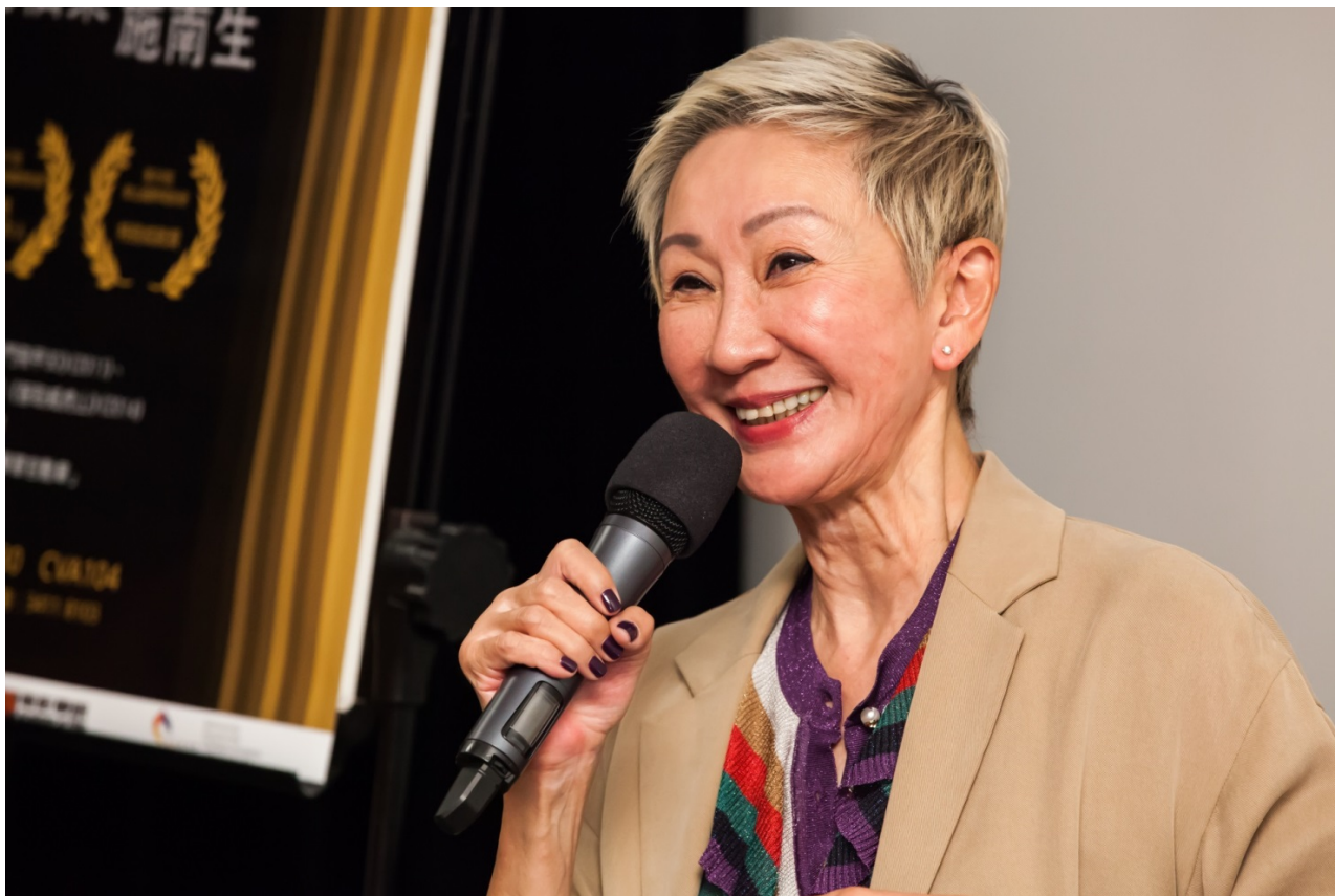
Masterclass with Locarno Film Festival Best Independent Producer Award-winning Nansun Shi