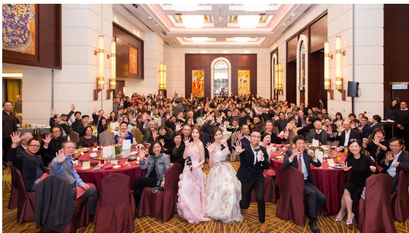
HKBU School of Communication 50th Anniversary - Academy of Film Reunion Dinner