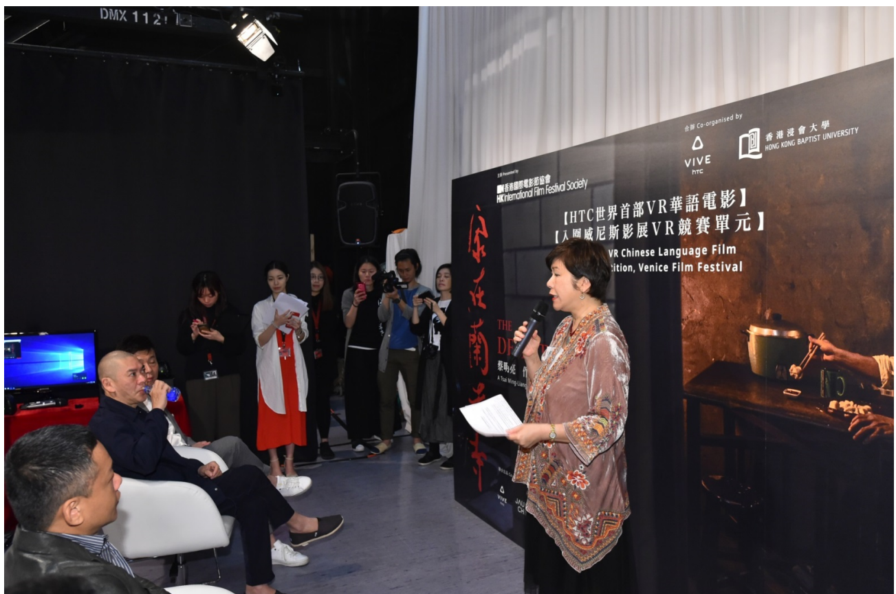
Masterclass with Venice International Film Festival Golden Lion winning Director Tsai Ming-liang