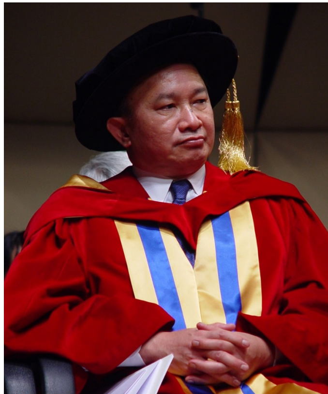
吳宇森博士 Dr. John WOO (電影導演 Film Director)