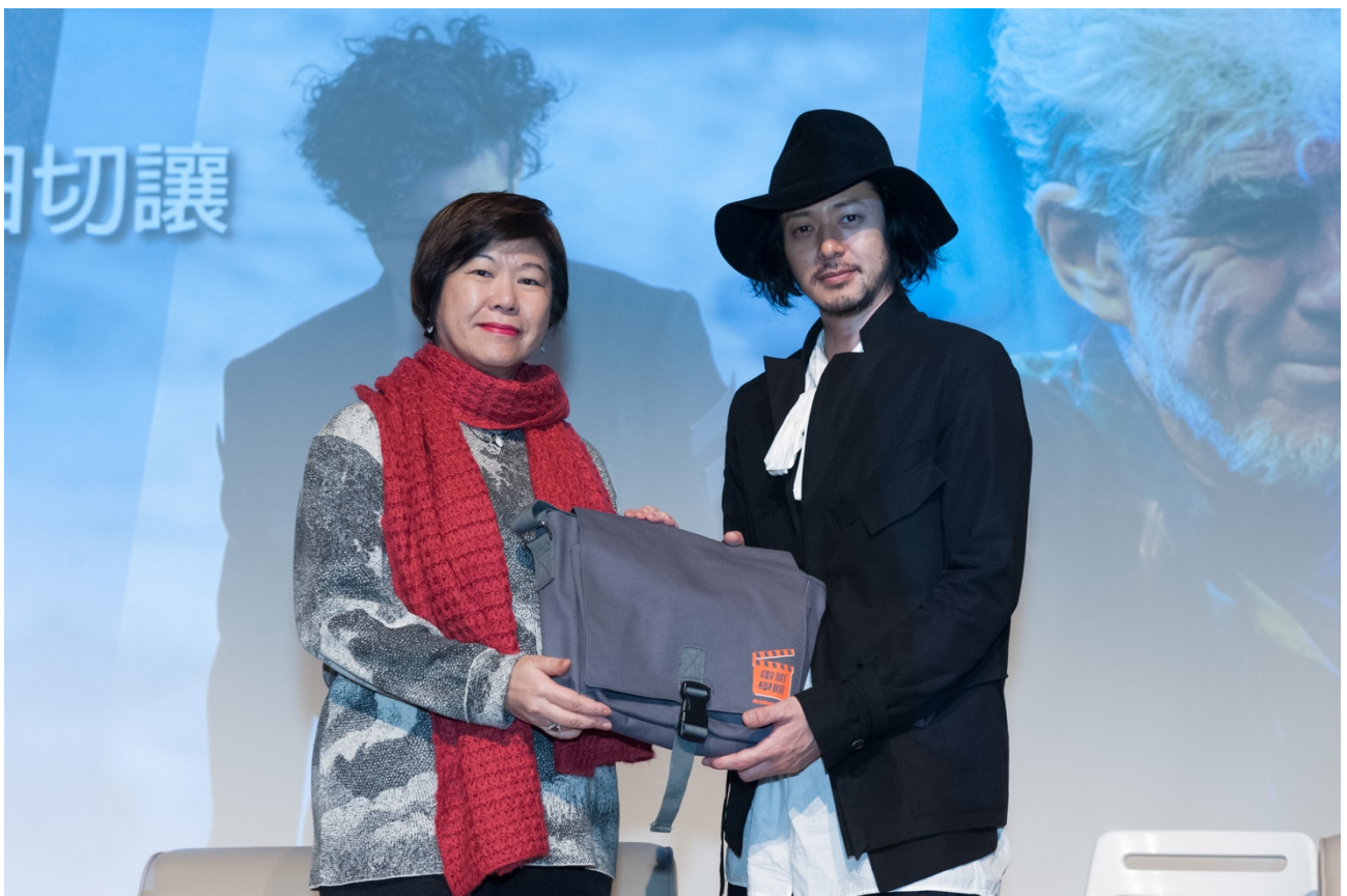
Masterclass with Award-winning Actor Joe Odagiri