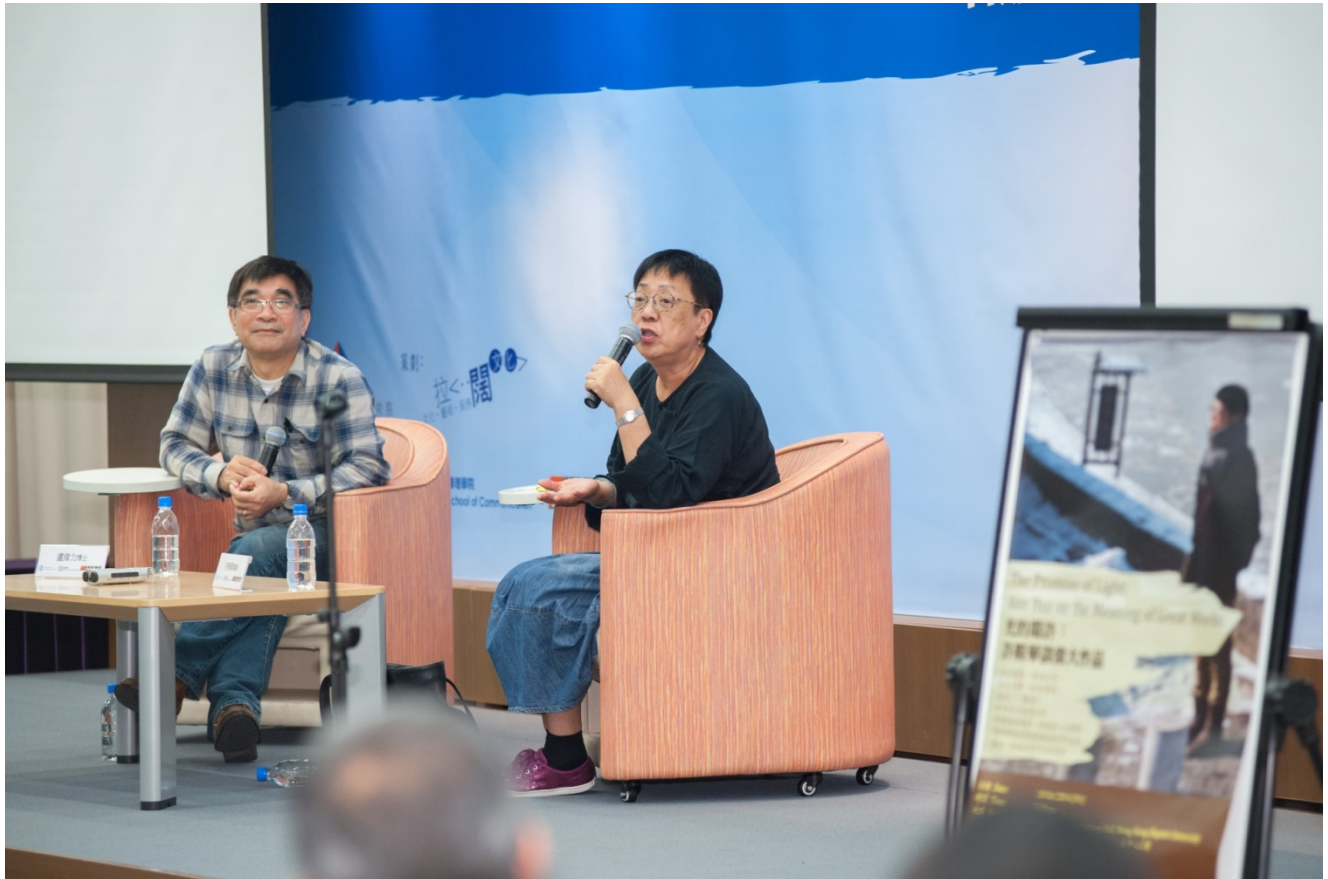
Masterclass with Award-winning Director Ann Hui