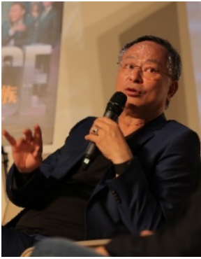
Award-winning Director Johnnie To