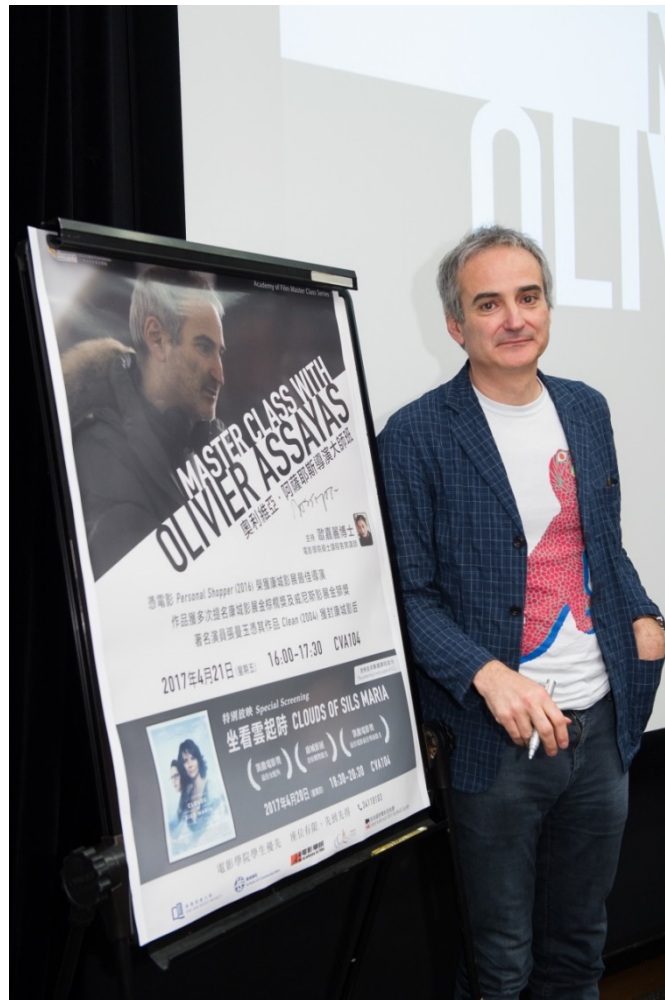
Masterclass with Cannes Film Festival Best Director Olivier Assayas