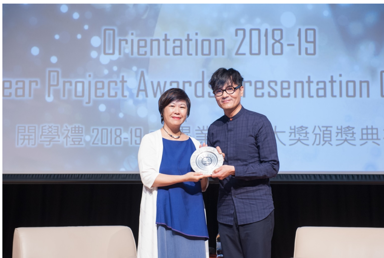
Orientation 2018-2019 Masterclass with Award-winning Actor Gordon Lam