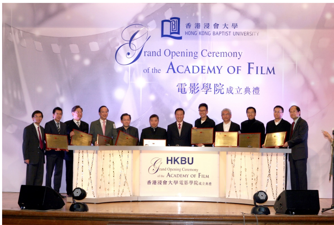
Opening Ceremony of the Academy of Film