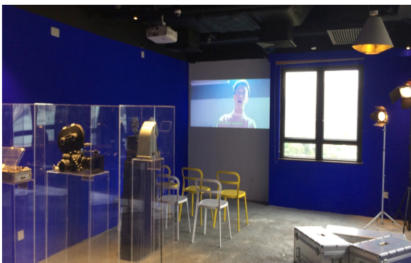
iSpace – a space for ideas