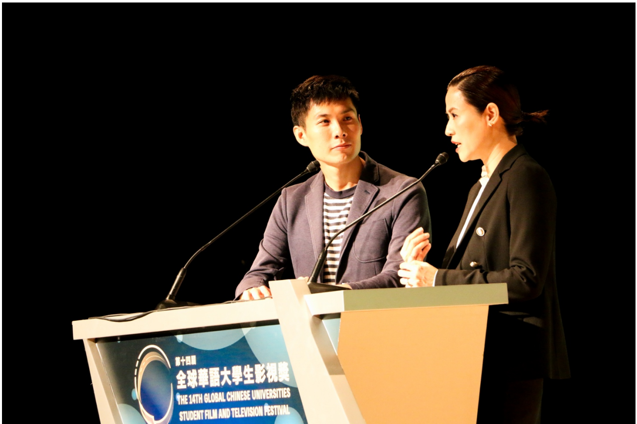
Award-winning Director Anthony Chen and Actress Jessica Hsuan