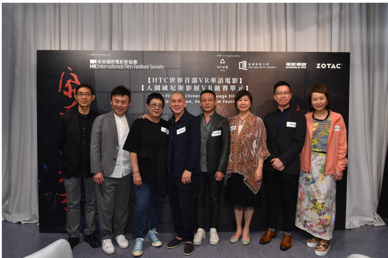
Masterclass with Venice International Film Festival Golden Lion winning Director Tsai Ming-liang