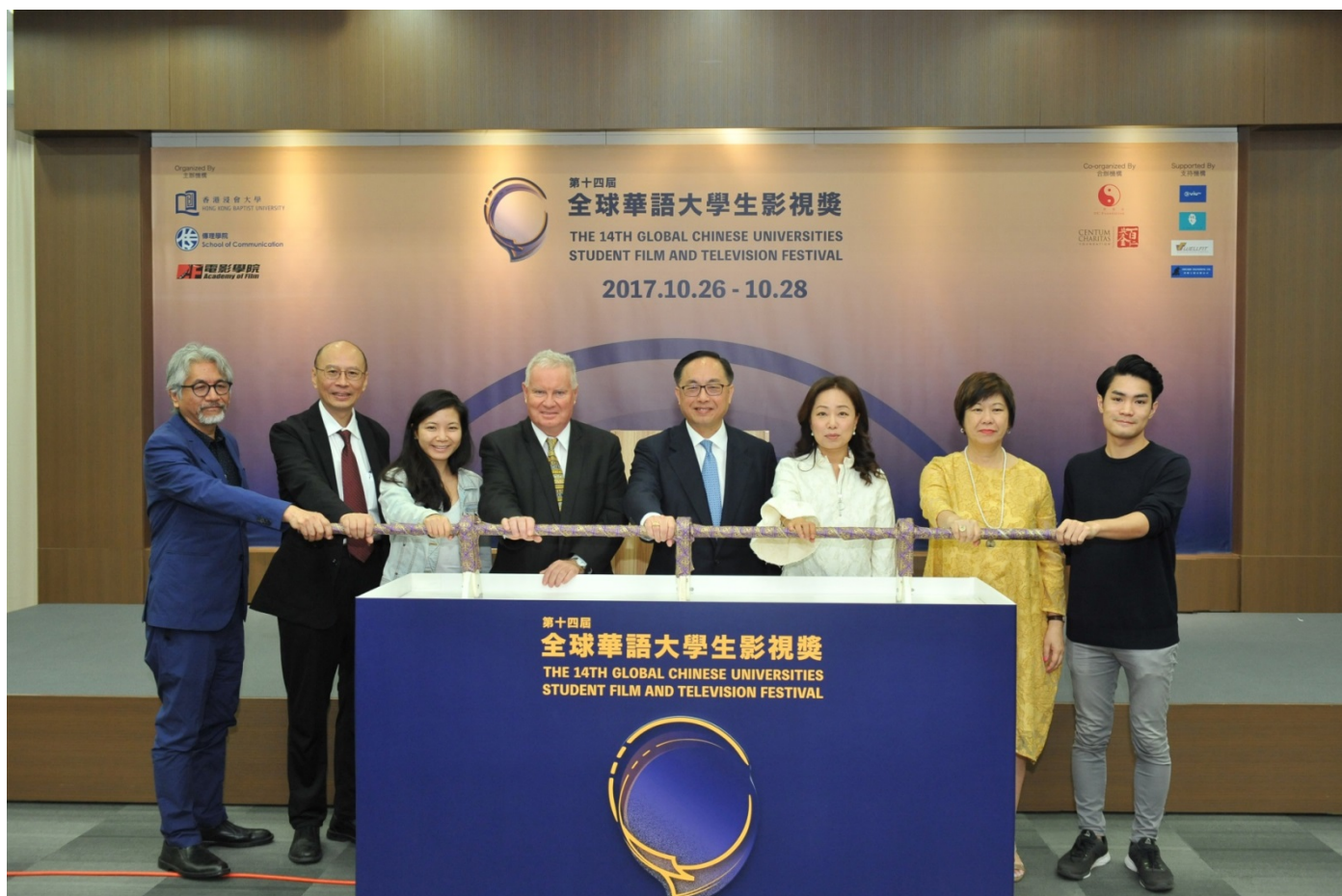
The 14 th Global Chinese Universities student Film and Television Festival (The 14 th GCU)