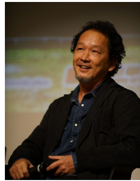
Veteran Actor Liu Kai Chi