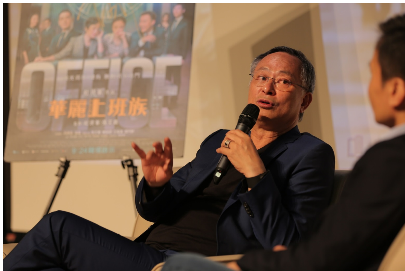
Masterclass with Award-winning Director Johnnie To