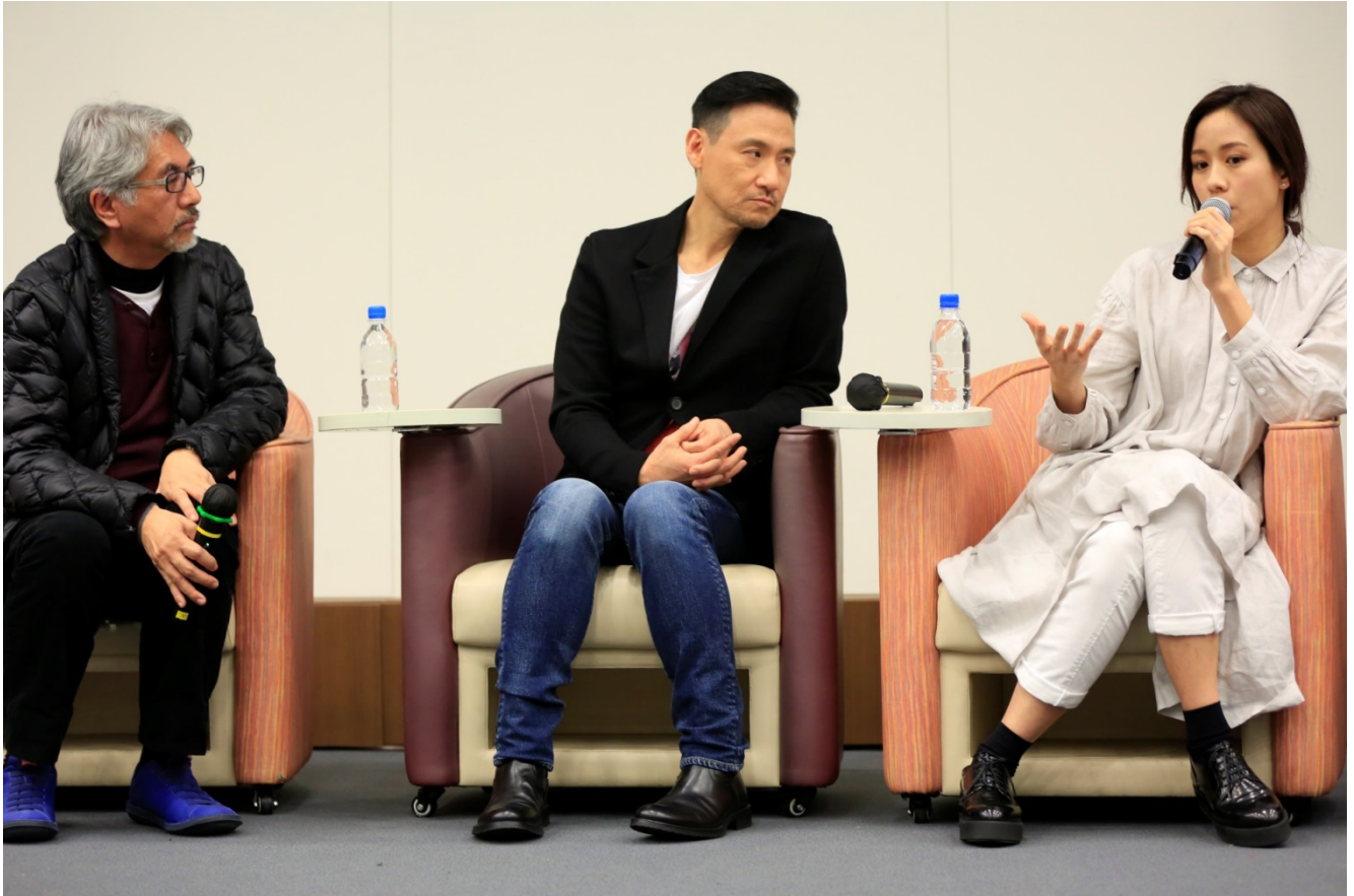
Masterclass with Award-winning Actor Jacky Cheung and Awards-winning Actress Karena Lam