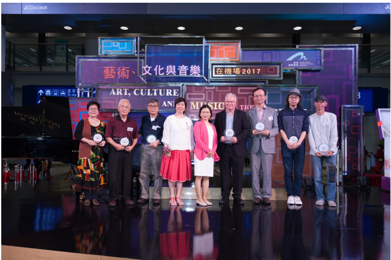
Cinema Fantasia Hong Kong Exhibition