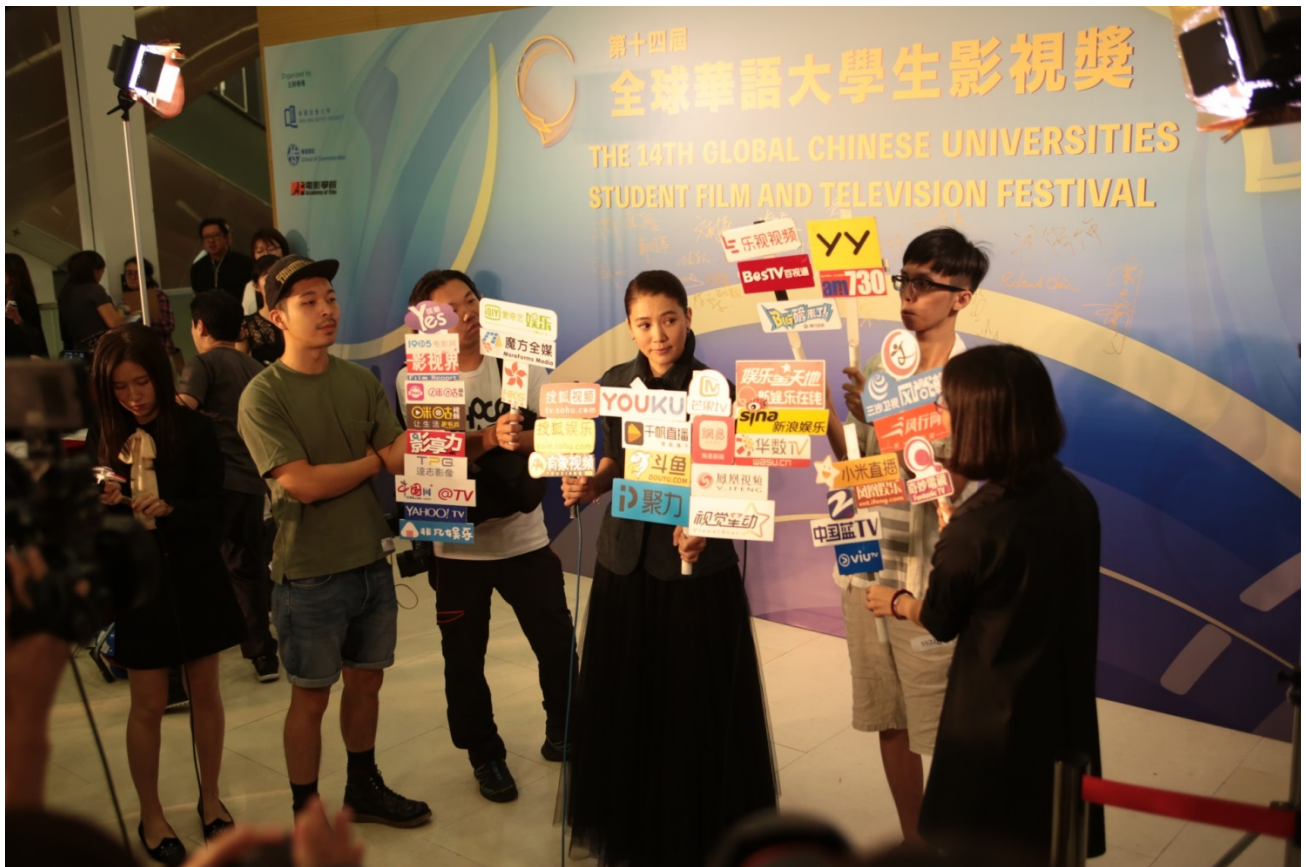
Award-winning Actress Anita Yuen