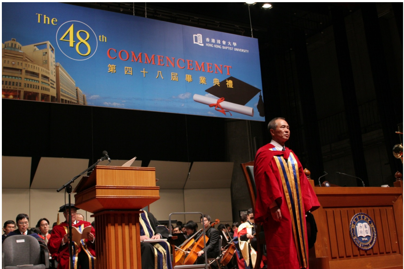
DR. HOU HSIAO HSIEN Awarded the degree of Doctor of Social Sciences, honoris causa