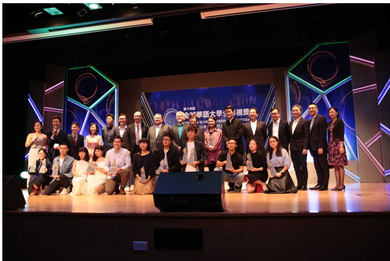
The 14 th GCU --- The Award Presentation Ceremony