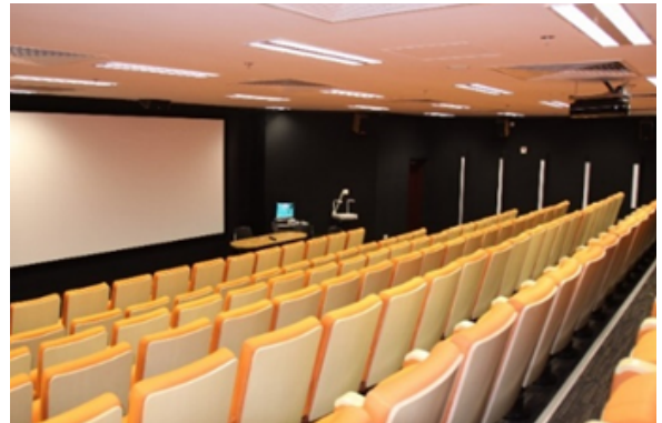
Professional 4K screening