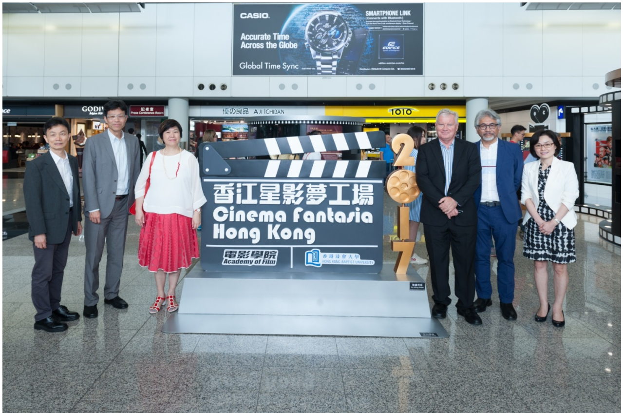
Cinema Fantasia Hong Kong Exhibition