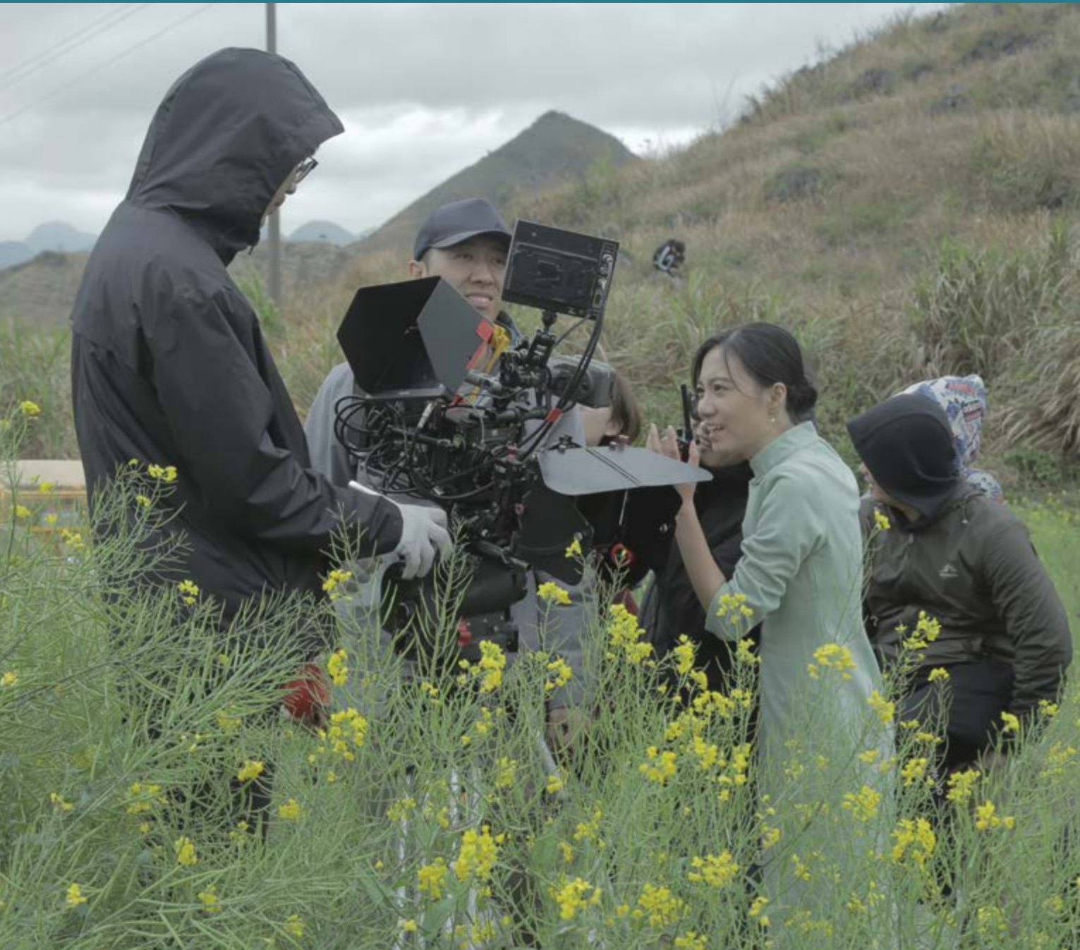
Master of Fine Arts in Film, Television and Digital Media