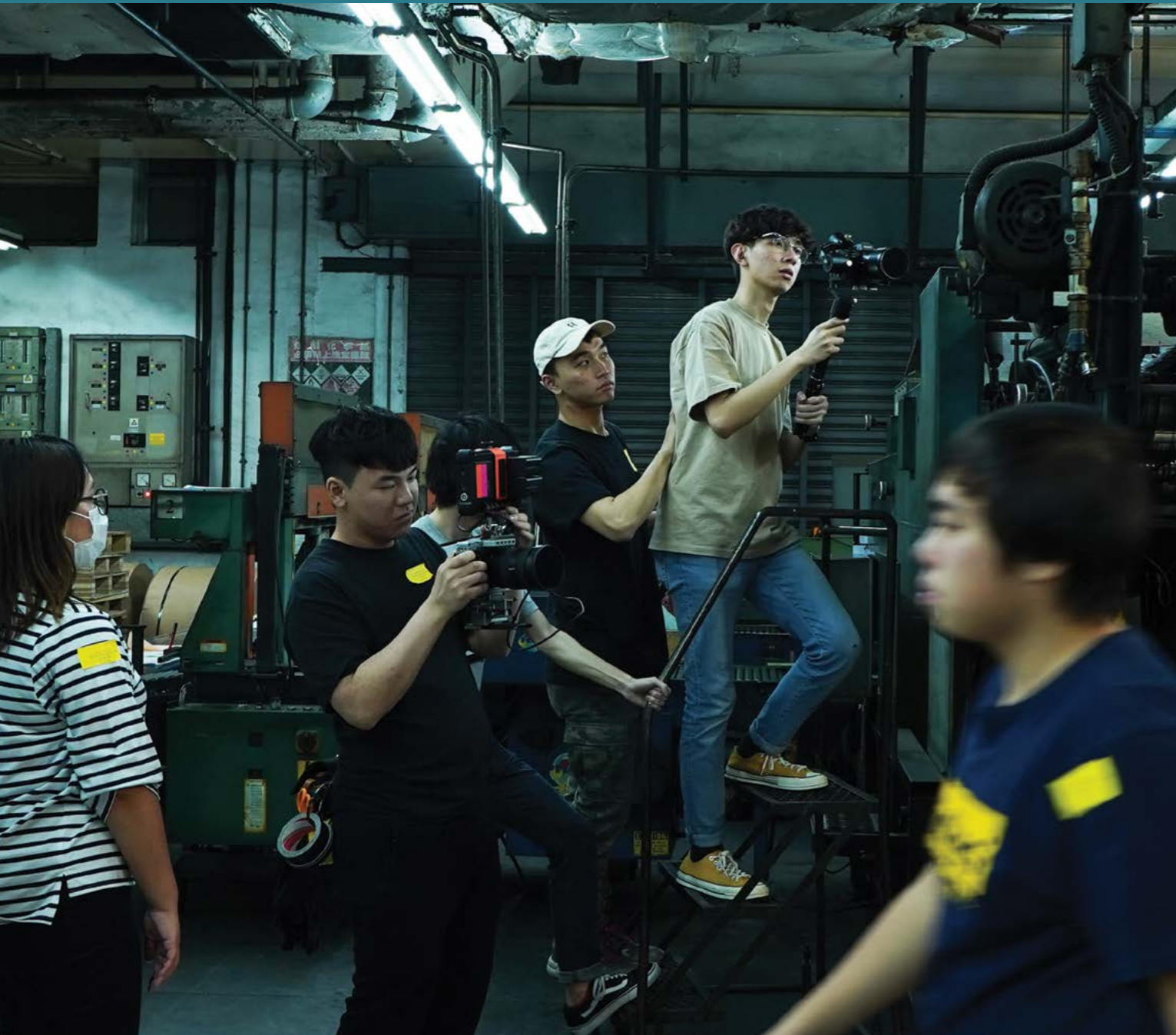
Bachelor of Arts (Hons) in Creative Writing for Film, Television and New Media