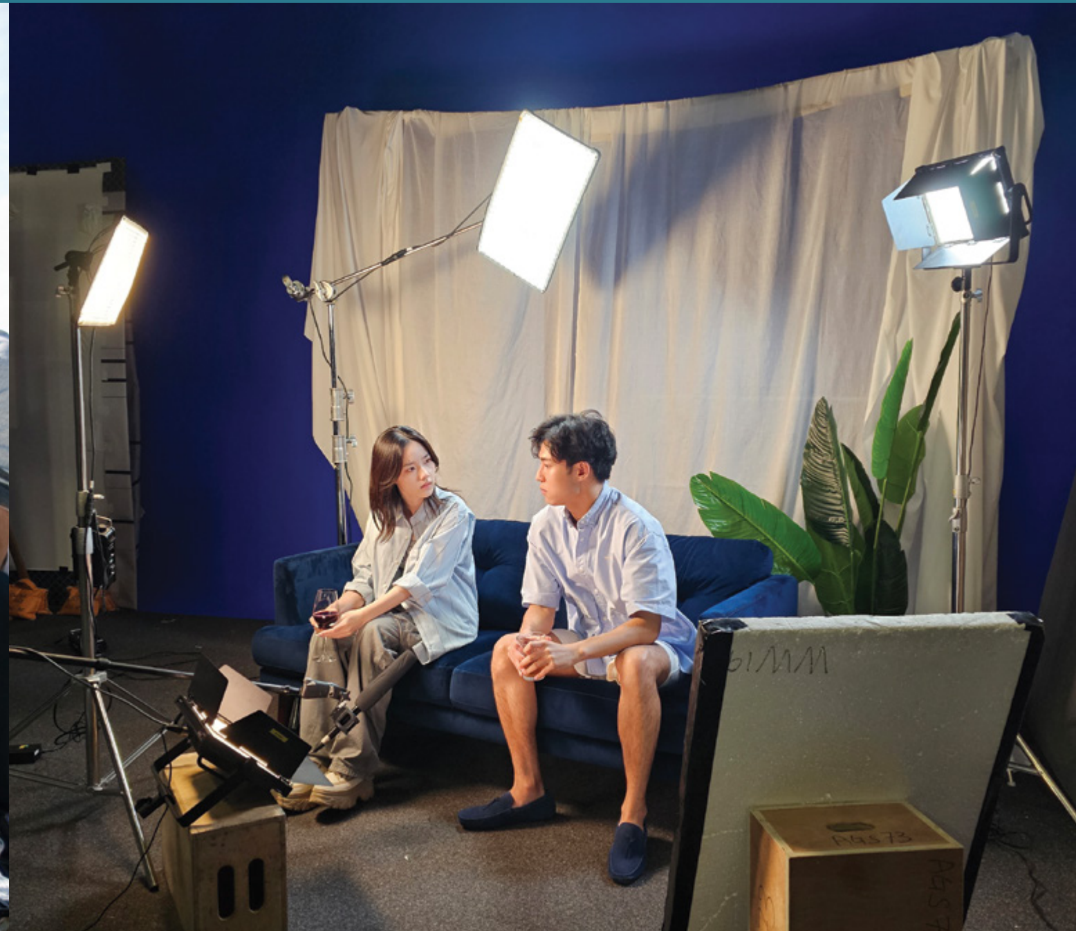
Bachelor of Fine Arts (Hons) in Acting for Global Screen