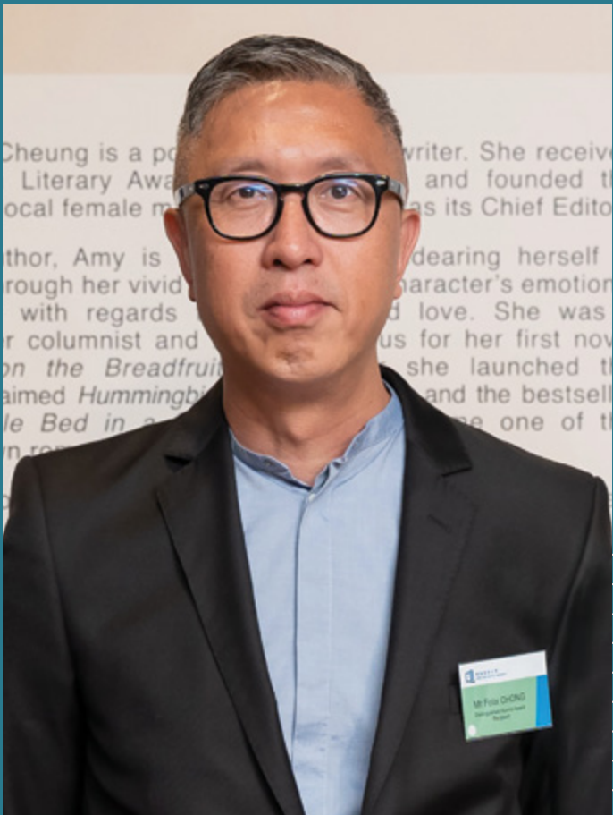
莊文強 Mr. Felix CHONG