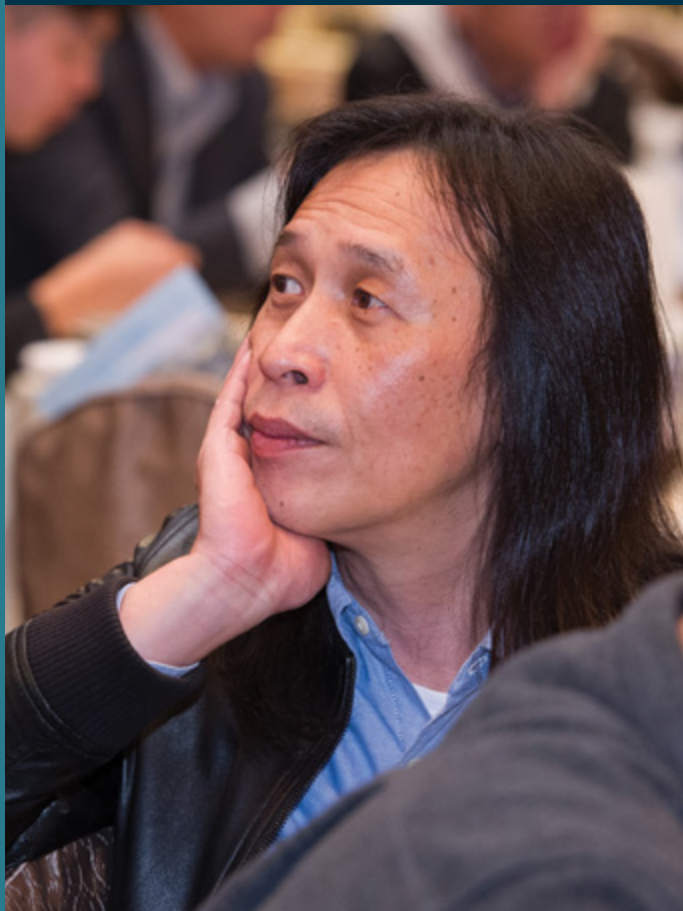
邱禮濤 Dr. Herman L.T. YAU

Alumnus Dr. Herman L.T. YAU is a well-known film director, cinematographer and writer.