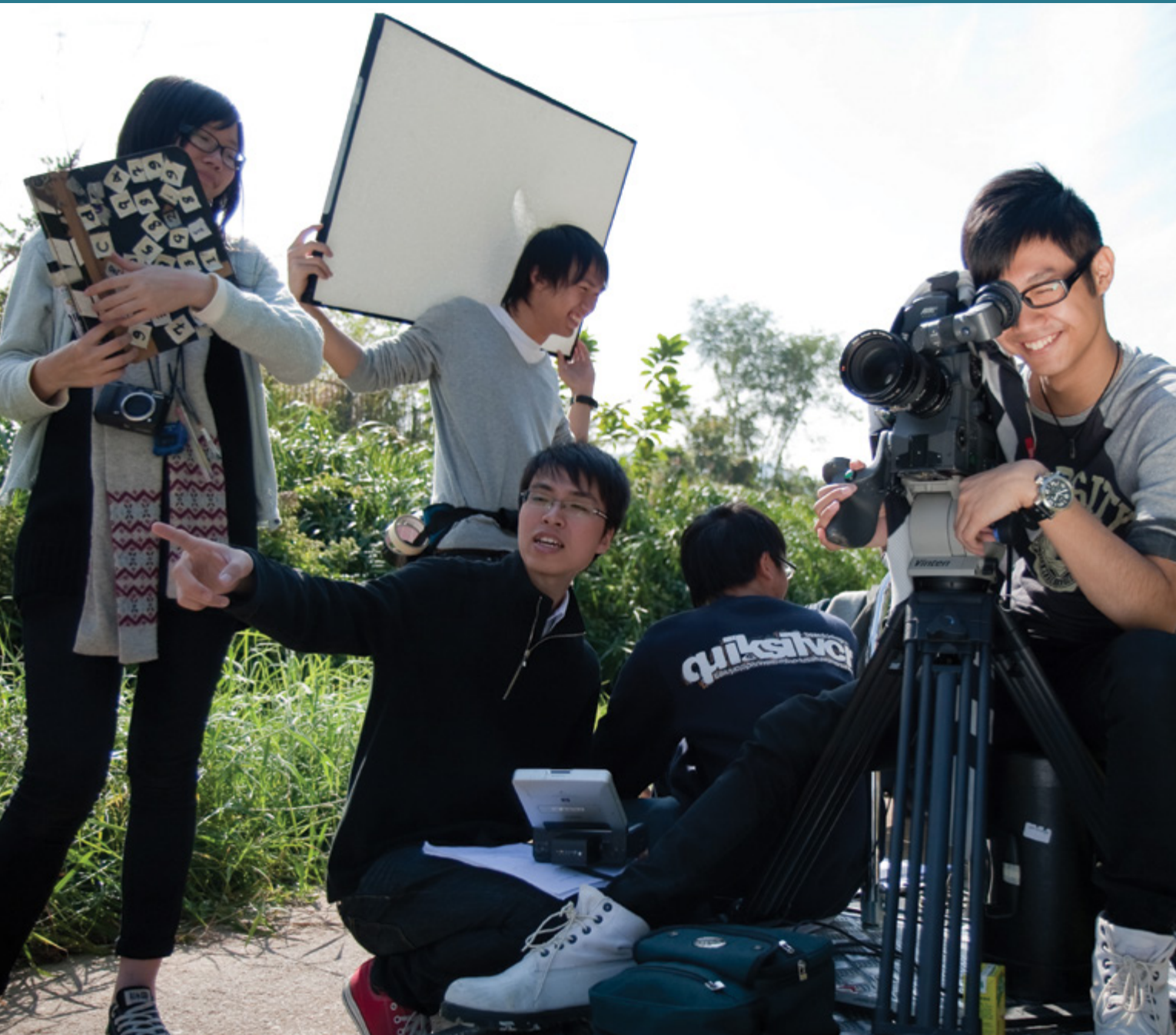
Bachelor of Arts (Hons) in Film and Television