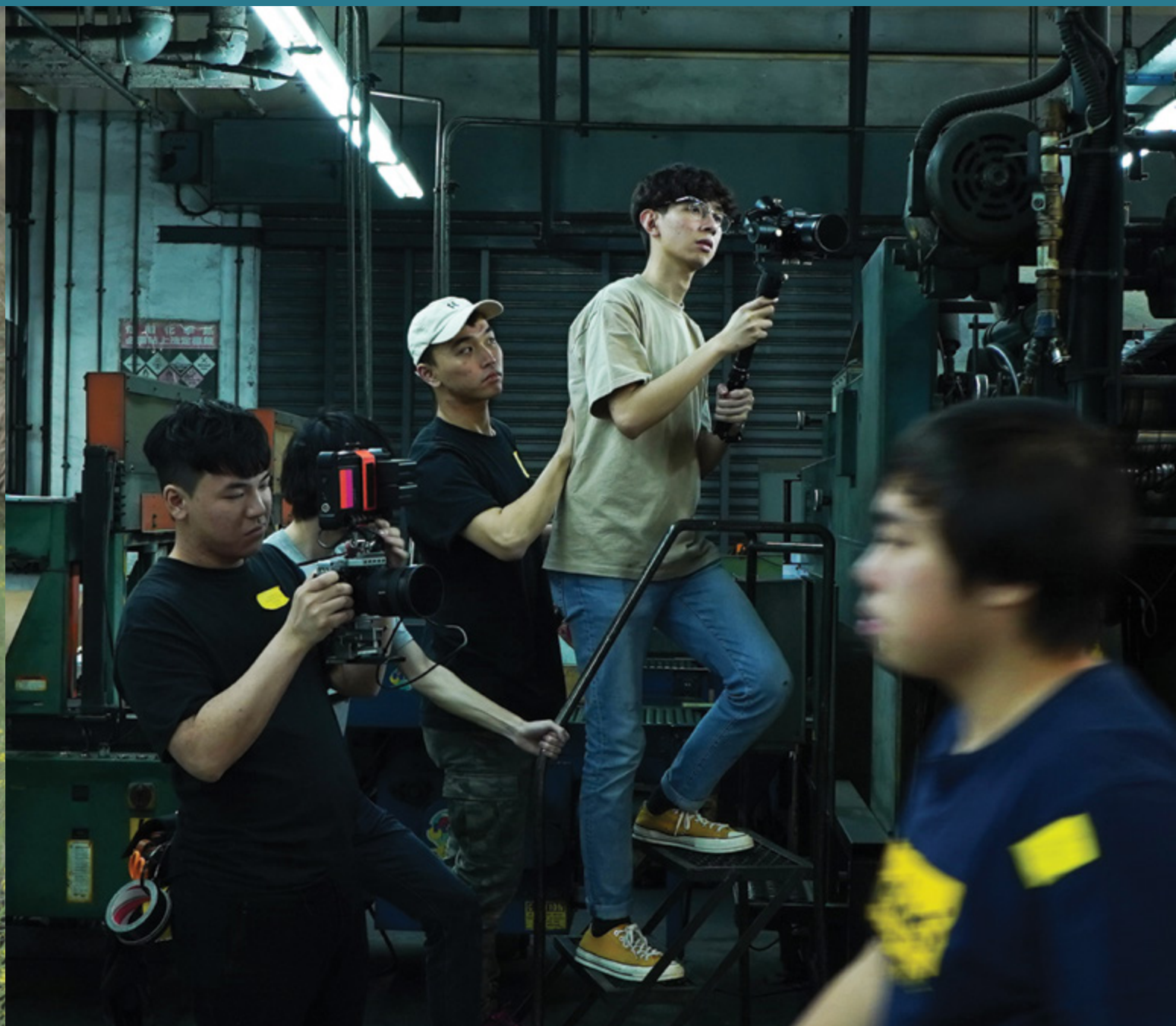
Master of Arts in Producing for Film, Television and New Media