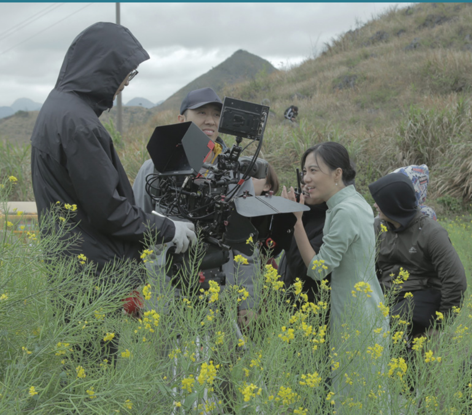
Master of Fine Arts in Film, Television and Digital Media